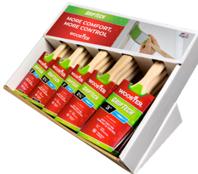
ANGLE COUNTER DISPLAY