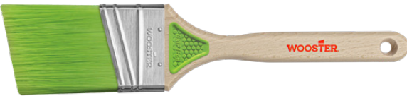
STYLE - Angle FERRULE - Round HANDLE - Sash