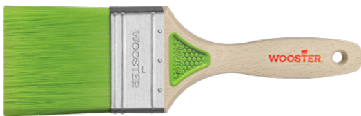
STYLE - Flat FERRULE - Round HANDLE - Beavertail